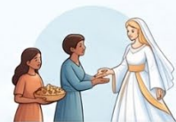
Those kind to the Bride