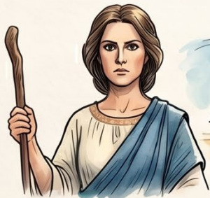
IDENTIFYING "GOOD ANGER"

While a wife is instructed to respect her husband's leadership, her ultimate obedience is always reserved for God and His Word.